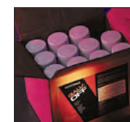
12 cans per case

Do not use common off-the-shelf lubricants on your machines. These paraffin based products actually attract dirt, grime and galvanized particles! Galv-Off is specially formulated to lubricate as it cleans. The spray nozzle has been developed to deliver an accurate and precise coating so you don't waste any. Handy 12 oz. aerosol size cans come in cases of 12. SDS (formerly MSDS) sheet provided.