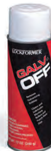
12 ounce aerosol size