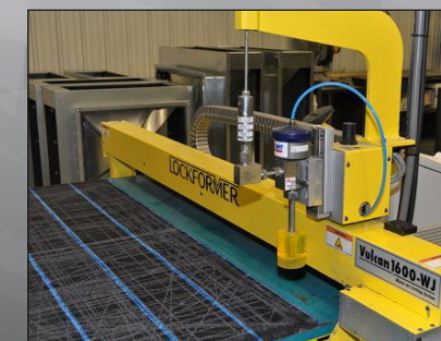
Vulcan 1600 WJ Waterjet® at work