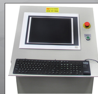
One Software Tool Control Console