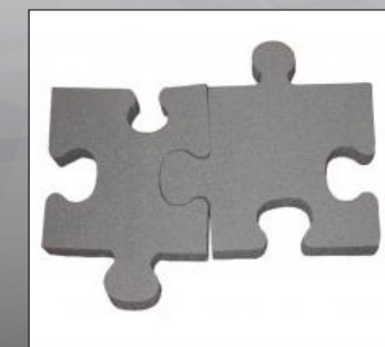
Precise and accurate cutting capability